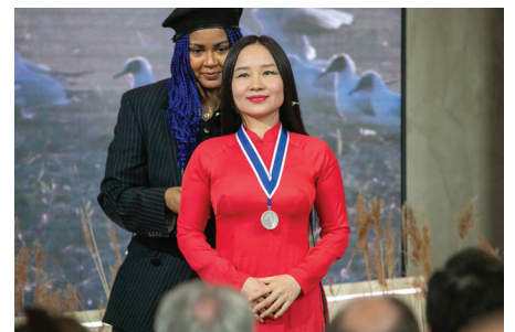
Roosevelt Four Freedoms Foundation